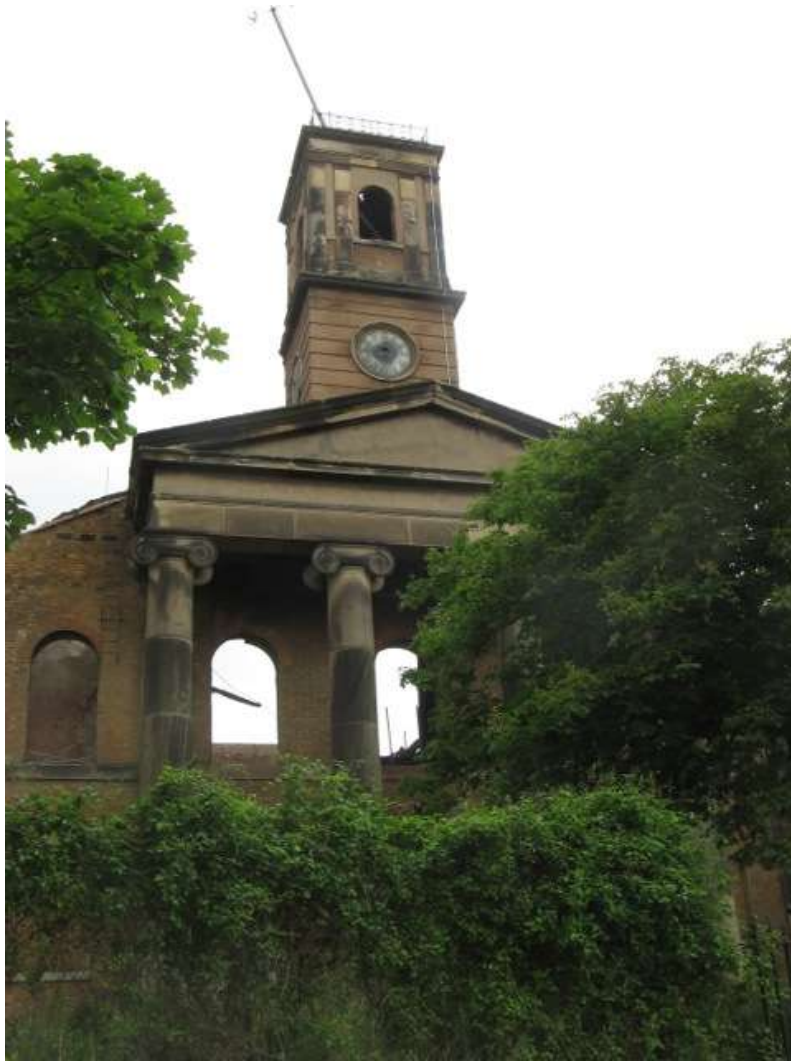
The Church today